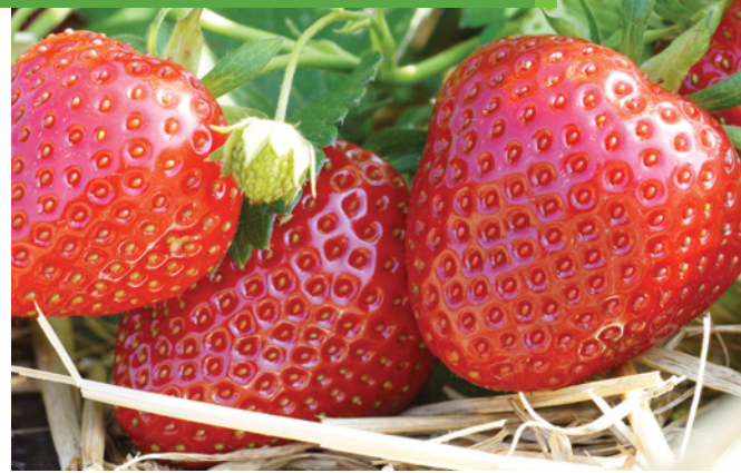
Cumulative yields of Rumba, Honeoye and Clery, grams per harvest, outdoor cultivation in the Netherlands

The harvest season of Rumba starts 5 to 6 days before Sonata. Forcing outdoor grown plants can shorten the onset of the harvest season by a further 4 to 7 days. The optimum harvest interval for Rumba is every 2 to 3 days.